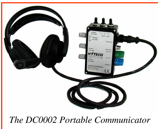
The DC0002 Portable Communicator