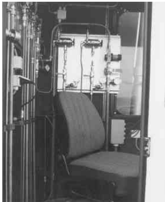
Interior of the diving cabin, with diving control panel.

Communications to the divers can be switched to this cabinet also, in this case the tender is able to listen to the communications. Systems like these are a specialty of Hytech .