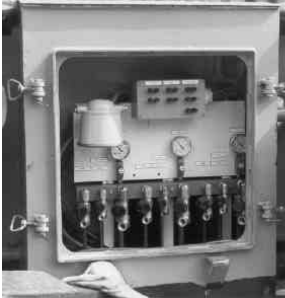
Umbilical cabinet at water entry site.

The ships we have equipped are operating world wide, such as: Middle East, Far East, etc.