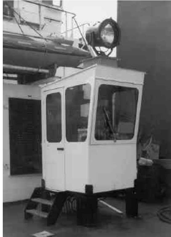
Diving control cabin.