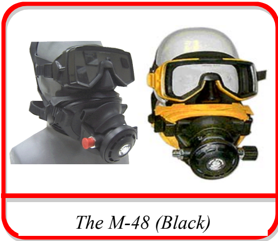
The M-48 (Black)

The Kirby Morgan SuperMask M-48 is a lightweight modular full face mask that allows for easy and rapid adaptation to various self contained underwater breathing apparatuses as well as surface supplied systems.