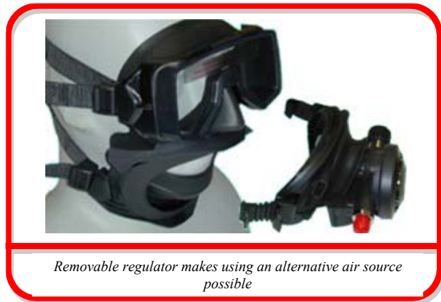
Removable regulator makes using an alternative air source possible