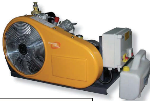
Shown with filtersystem P31