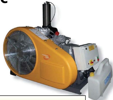
Shown with filtersystem P42-securus